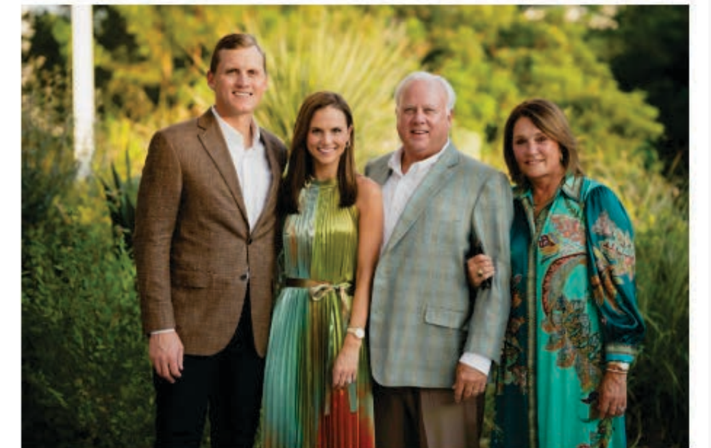
Highlights from Glow in the Park 2024.

December 2, 2024 by Rob Giardinelli 2 mins read