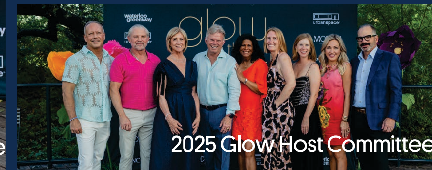
2025 Glow Host Committee