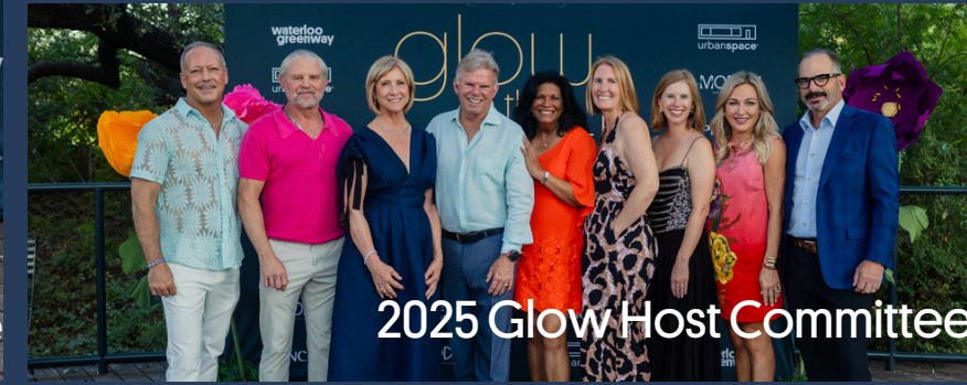
2025 Glow Host Committee